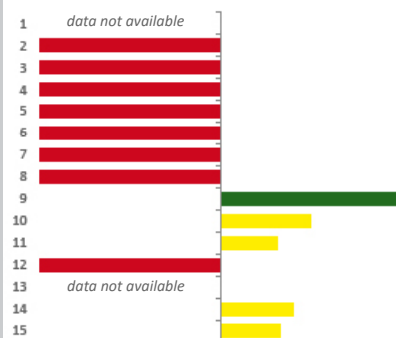
Chart 2 - How Big?